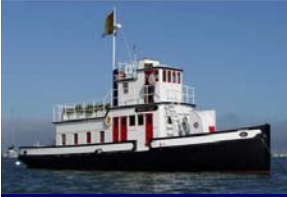
Tugboat chugging along Coos River.