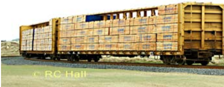
Lumber Train leaving South Port