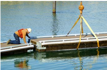
Charleston Boat Ramp Construction