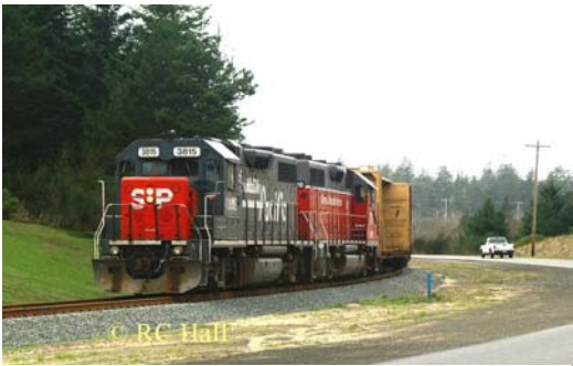
Train on new North Spit Rail Line