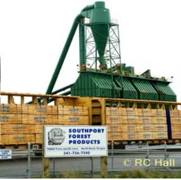
Lumber Train at South Port Forest Products On North Spit