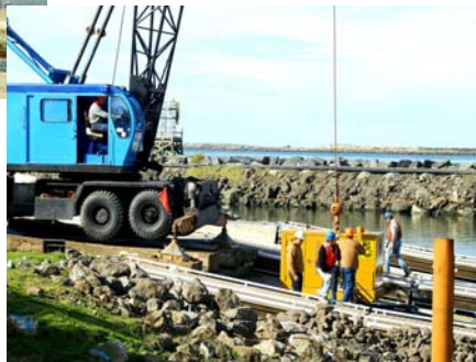
More progress in Charleston